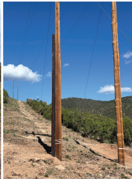
A damaged power pole, shown left with gunshot holes, has been stabilized with a 35-foot pole, right, until weather and conditions allow crews to make a permanent replacement.