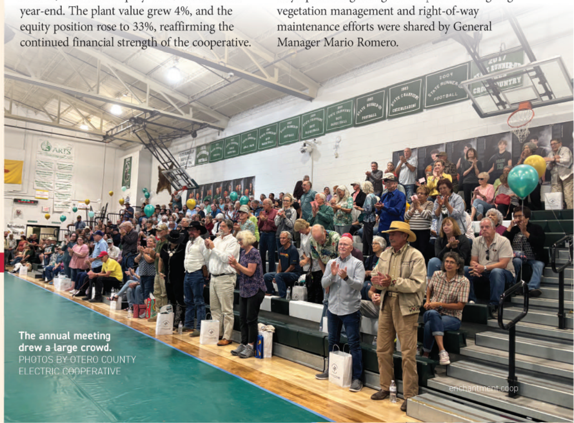
The annual meeting drew a large crowd.