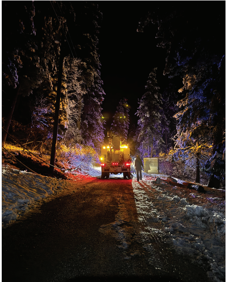
Otero County Electric Cooperative line crews often work through the night to restore power during power outages.

While our crews are focused on restoring your power, their safety is our utmost priority. If their safety is compromised