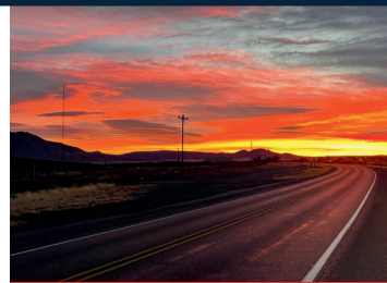
JANUARY CALENDAR PHOTO