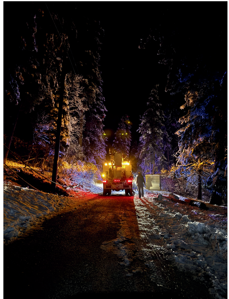
A great depiction of a line truck and crew patrolling to identify the cause of an electric outage during the night.

We kindly ask for your cooperation when you see crews working to keep these areas clear. This task plays a vital role in reducing fire hazards and ensuring consistent power delivery to members.