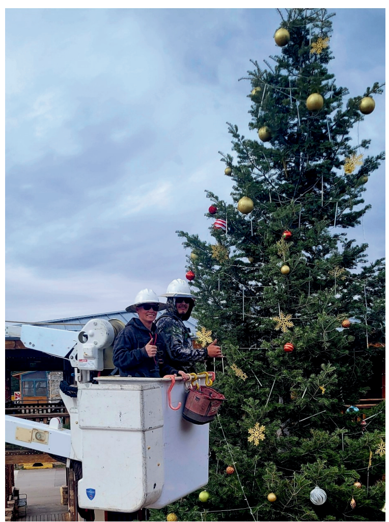
OCEC line crew members Cable Angelus and Carlos Cano assist with decorating the Village of Cloudcroft Christmas Tree that sits in the courtyard of the OCEC Headquarters building.