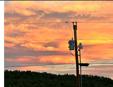
APRIL CALENDAR PHOTO submitted by Tawnya Lucero