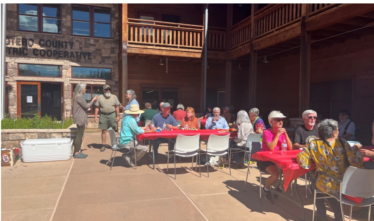
Many members enjoyed the fellowship with neighbors and a wonderful lunch at the OCEC Headquarters on September 23.