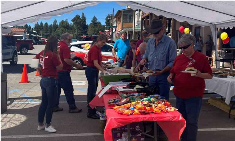
Folks line up to grab their lunch at the 2022 Member Appreciation Cookout.

As a cooperative, we were created to serve our members, and this event was a perfect way to show our appreciation for each and every one of you! We hope to see you at our next co-op sponsored event.