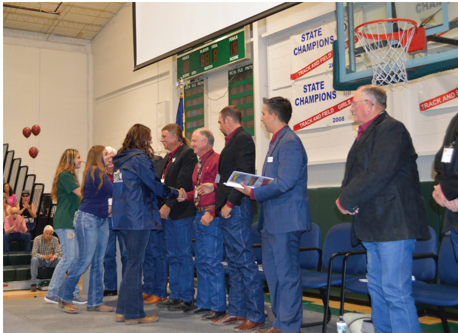
Otero County Electric Cooperative board members congratulate the 2023 scholarship recipients at the 2023 annual meeting.